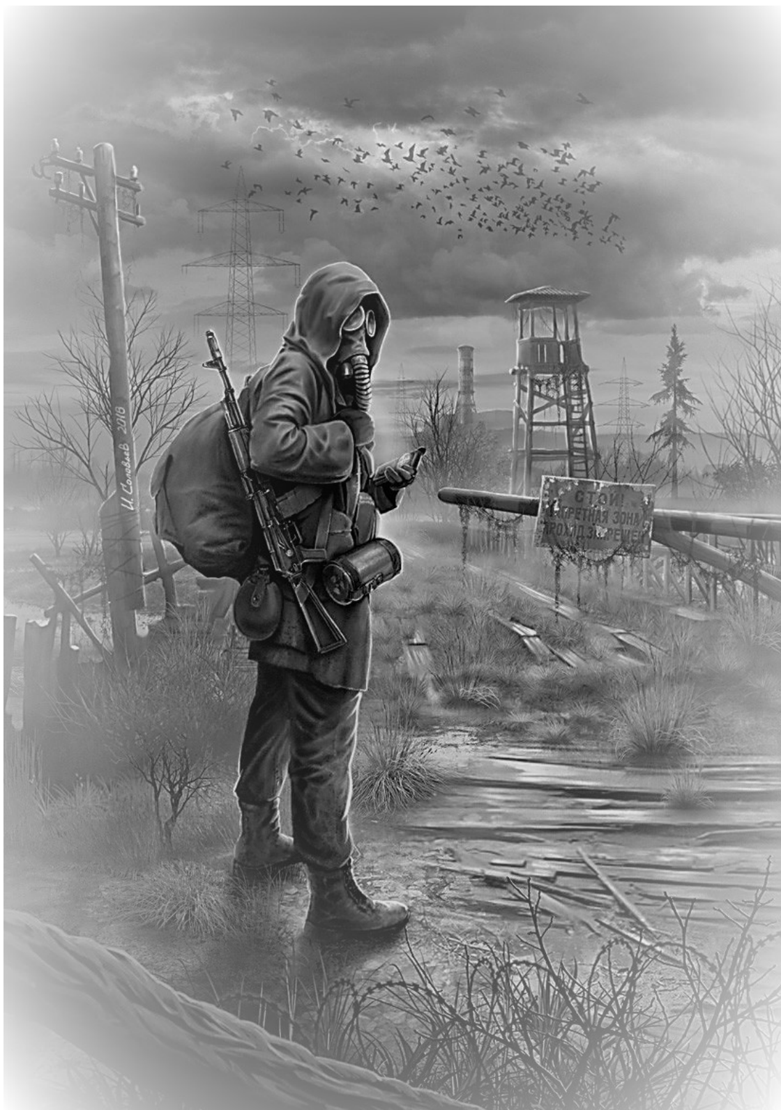
Last known photograph of Yuri Bonyev